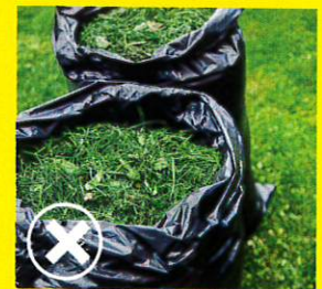
DO NOT BAG GREEN WASTE